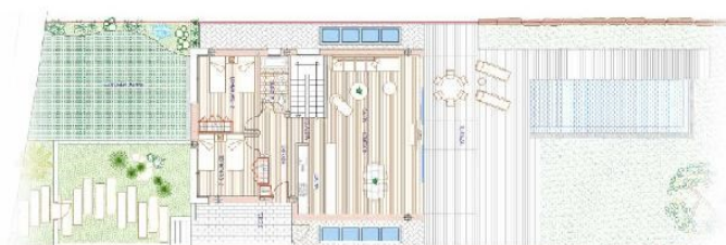
THE PALM COLLECTION Modelo L

Superficie construida: 320,45 m 2 Superficie terrazas: 278,45 m 2 Superficie parcela: 912 m 2