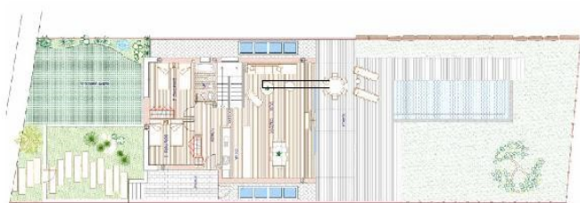
THE PALM COLLECTION Modelo E

Superficie construida: 320,45 m 2 Superficie terrazas: 278,45 m 2 Superficie parcela: 912 m 2