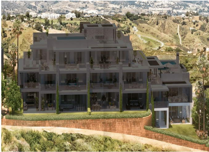
Apartment 5.0.1 TYPE B

3 Bedrooms | 3 Bathrooms | 199 m 2 Interior | 48 m 2 Terraces | Garage Yes | Pool Yes |