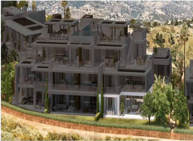
BLOCK 4 Apartment 4.0.1 TYPE C

3 Bedrooms | 3 Bathrooms | 275 m 2 Interior | 110 m 2 Terraces | Garage Yes | Pool Yes |