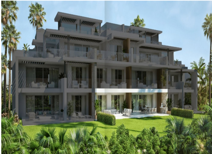
BLOCK 3 Apartment 3.0.2 TYPE A2

2 Bedrooms | 2 Bathrooms | 203 m 2 Interior | 71 m 2 Terraces | Garage Yes | Pool Yes |